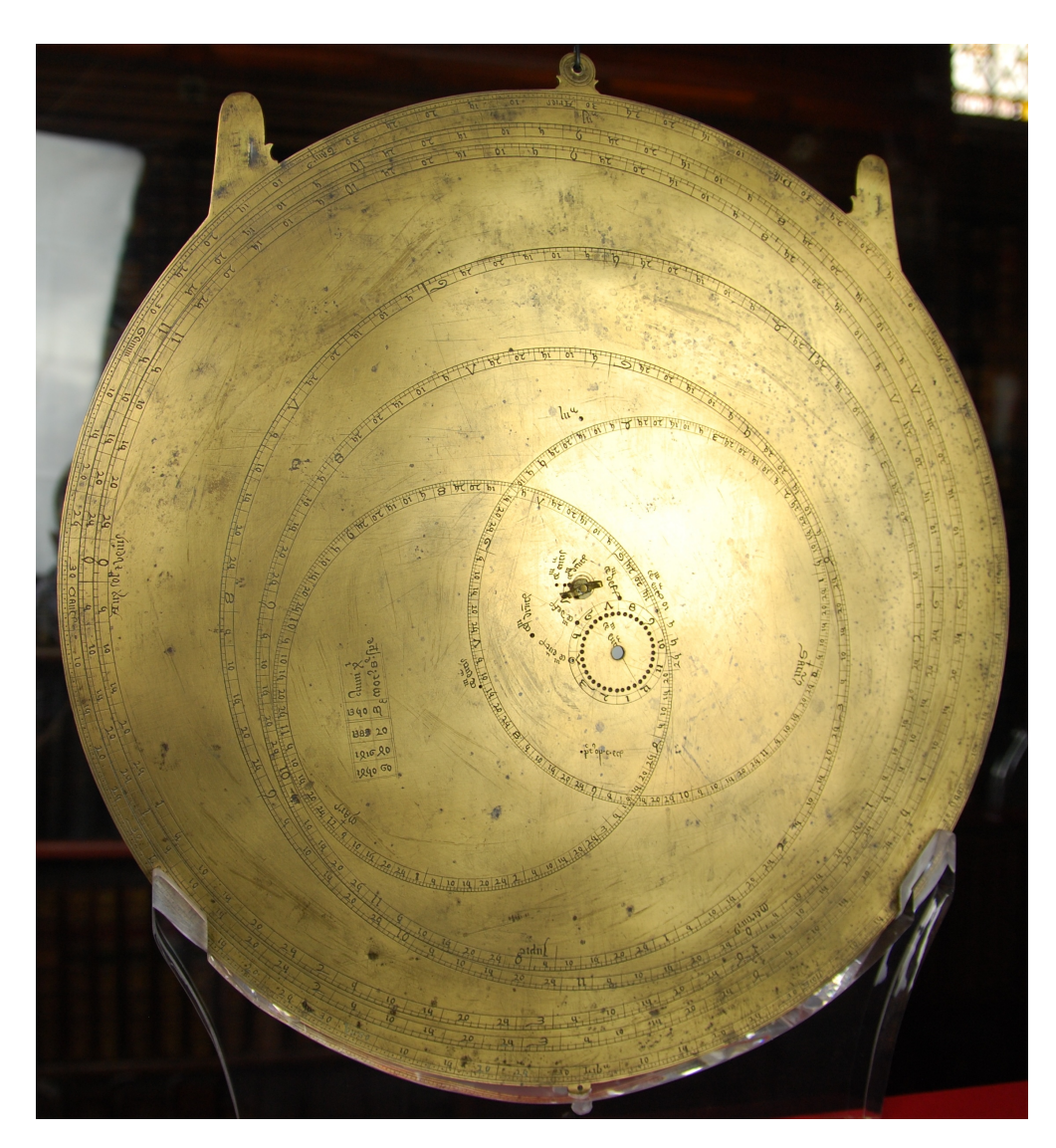
Figure 1 : Back of Merton astrolabe-equatorium, c. 1350 (Merton SC/OB/AST/2).